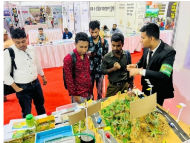
Student explains projects to visitors