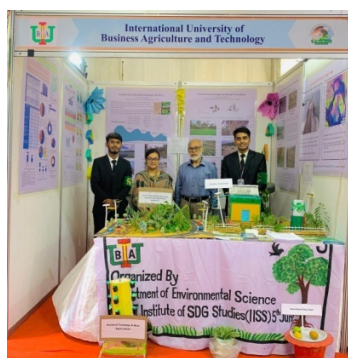
Chairman of DES, Faculty and Students