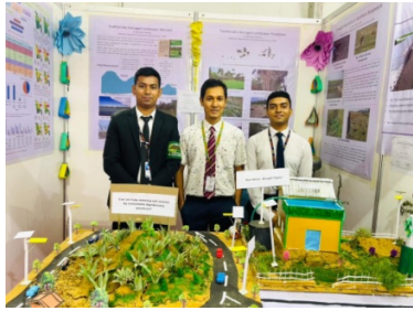
Faculty and Students