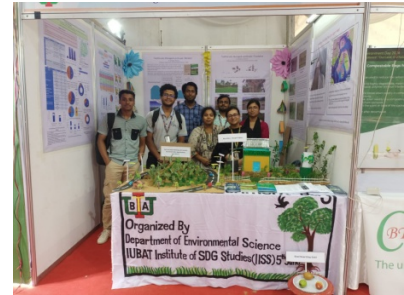
Faculty and Students

The IUBAT stall was met with great enthusiasm and appreciation from visitors and organizers alike. The participation provided a valuable learning opportunity for students, who volunteered at the stall and gained practical experience in environmental advocacy and project presentation.