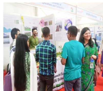
Faculty and Visitors

The stall presented four major projects: